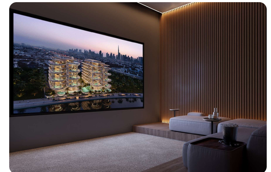
Private Cinema Room Visualisation from developer