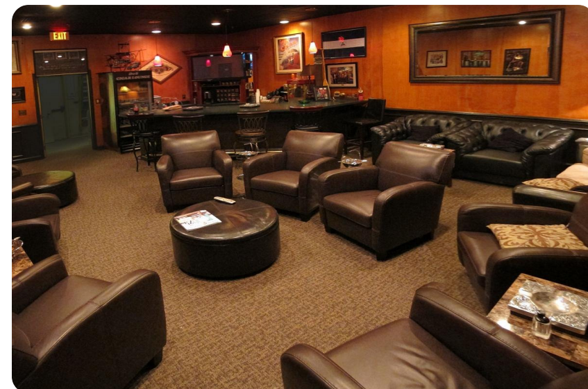
Cigar Lounge Image for general understanding