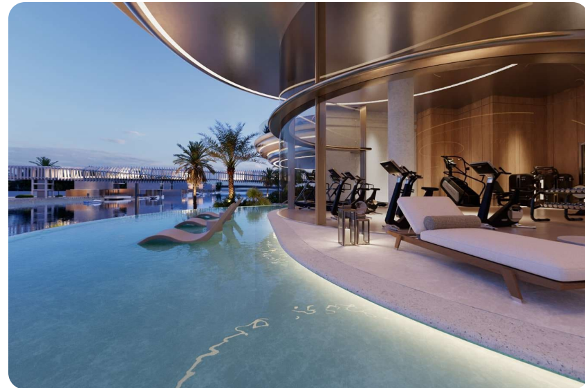
Private Swimming Pool Visualisation from developer