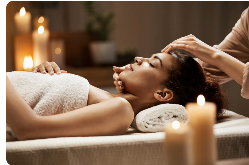
Wellness and Beauty Center Image for general understanding