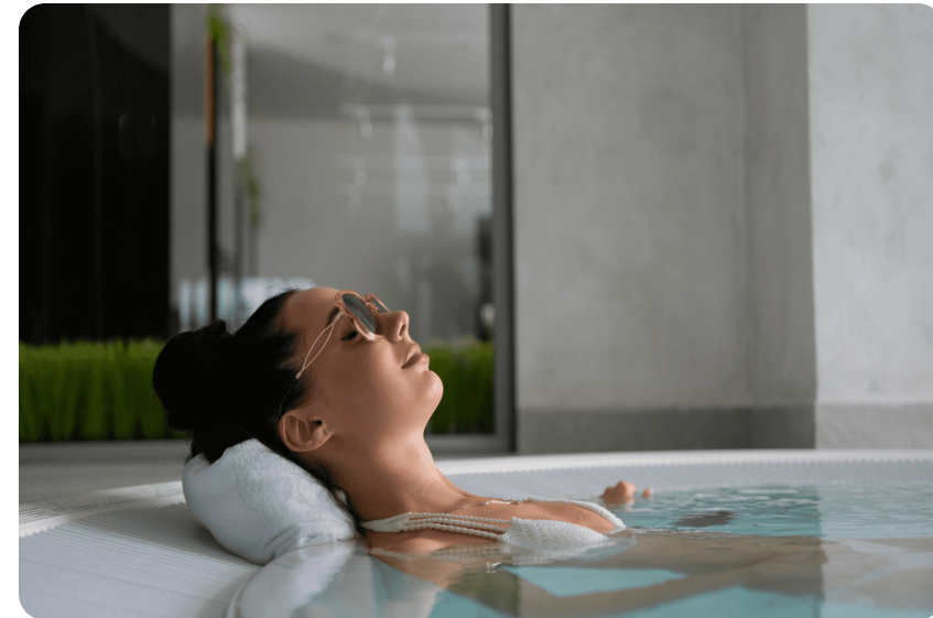
World-Class SPA Image for general understanding