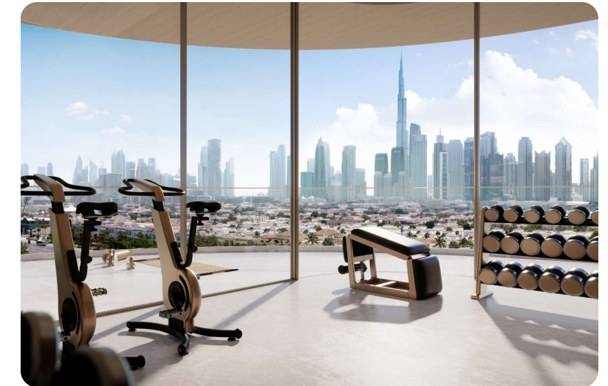
Yoga and Gym Visualisation from developer