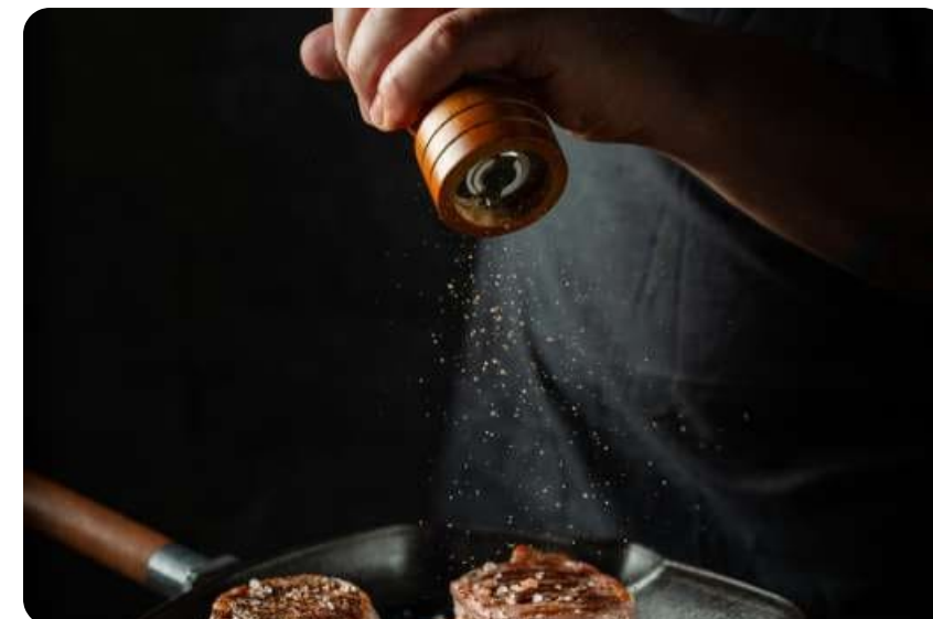
Outdoor Grilling Station Visualisation from developer