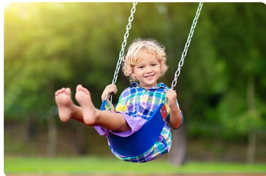
Kids' Play Area Image for general understanding