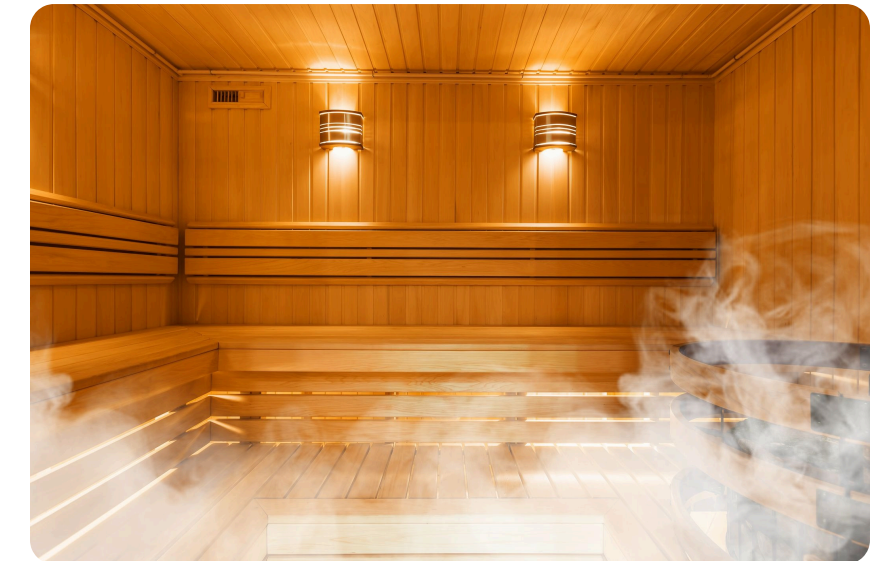
Steam Room And Sauna